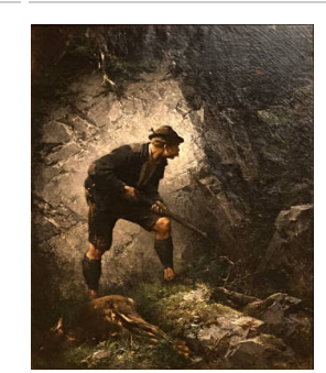
Title: Der Wilderer