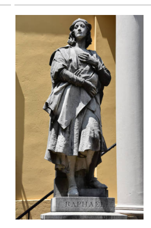
Title: Raphael Date: c. 1883 Primary Maker: Viktor