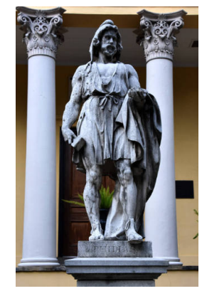
Title: Phidias Date: c. 1883 Primary Maker: Viktor Oskar Tilgner