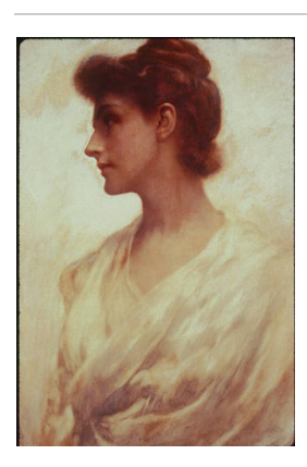
Title: Pensive Date: 1888