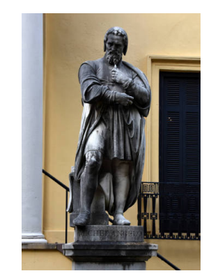
Title: Michelangelo Date: c. 1883