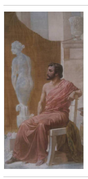
Title: Praxiteles Date: 1890 Primary Maker: Carl Brandt