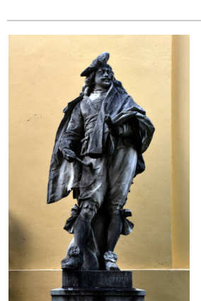
Title: Rembrandt Date: c. 1883 Primary Maker: Viktor Oskar Tilgner