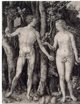
Title: Adam and Eve Date: 1504 Primary Maker: Albrecht Dürer Medium: Engraving on paper