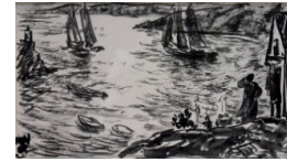
Title: By the Water's Edge Date: 1922 Primary Maker: Gifford Beal Medium: gouache, ink and wash on cream wove paper