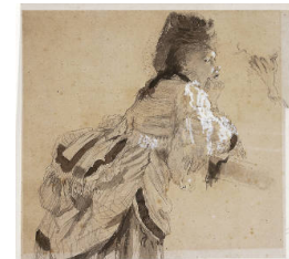
Title: Study for La Tamise Date: c. 1871 - 1872 Primary Maker: James Tissot Medium: ink and gouache over graphite on paper