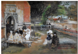
Title: The Overflow Date: n. d. Primary Maker: George Henry Boughton Medium: Body color, watercolor and charcoal on paper