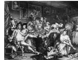
Title: O'Vanity of Youthful Blood Date: 1735 Primary Maker: William Hogarth Medium: Etching and engraving on heavy laid and chain paper