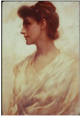
Title: Pensive Date: 1888 Primary Maker: Reginald Barber Medium: gouache on paper