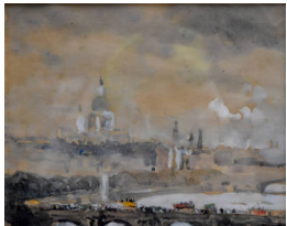
Title: View of London Date: 1914 Primary Maker: Joseph Pennell Medium: Body color, watercolor on paper