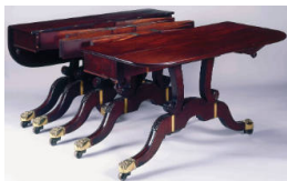
Title: Extension Dining Table Date: c. 1815 - 1820 Primary Maker: Unknown Medium: Mahogany, pine, maple and brass inlay