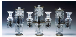
Title: Argand Lamp Date: c. 1820 Primary Maker: Unknown Medium: gilt bronze, brass, and cut glass