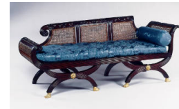
Title: Récamier Date: c. 1820 Primary Maker: Unknown Medium: Mahogany, cane, upholstery, and ormolu