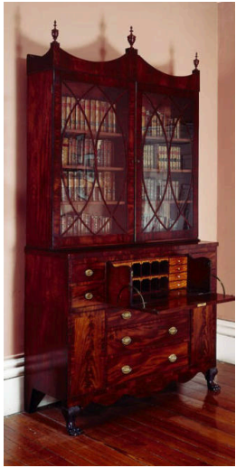
Title: Secretary and Bookcase Date: c. 1815-1820 Primary Maker: Unknown Medium: Mahogany, satinwood veneer, white pine, poplar, brass, and glass