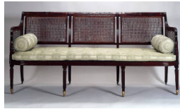
Title: Settee Date: c. 1805 - 1810 Primary Maker: Unknown Medium: Mahogany, cane and silk upholstery