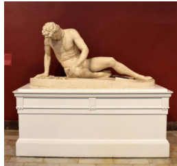
Title: Dying Gaul Date: 1883 Primary Maker: Giovanni Lucignani Medium: Plaster cast