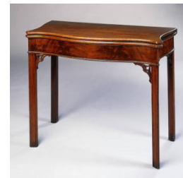
Title: Card Table Date: c. 1795 - 1810 Primary Maker: Unknown Medium: Mahogany and mahogany veneer with interior woods of cypress inner frame, ash gate frame, and red cedar front frame core