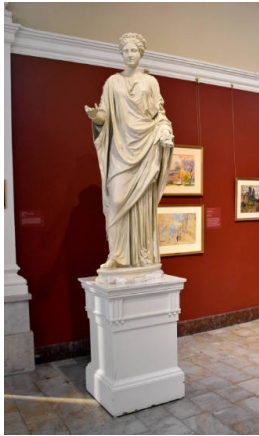
Title: Flora Date: 1883 Primary Maker: Giovanni Lucignani Medium: Plaster cast