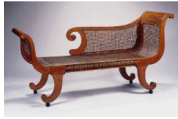
Title: Couch Date: c. 1820 Primary Maker: Unknown Medium: Maple with curly maple and bird's eye maple veneers, cane