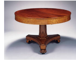
Title: Center Table Date: c. 1820 -1830 Primary Maker: Unknown Medium: Bird's eye maple, mahogany, white pine, and poplar