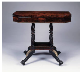
Title: Card Table Date: c. 1800 - 1815 Primary Maker: Unknown Medium: Mahogany, mahogany veneer, cherry, poplar, white pine, and brass