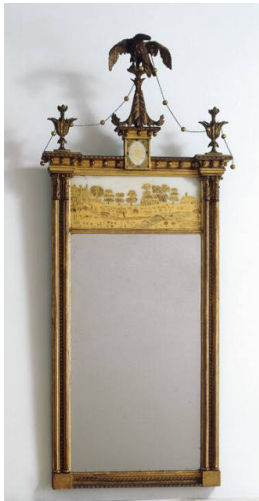
Title: Looking Glass Date: c. 1800 - 1810 Primary Maker: Unknown Medium: Wood, gilding, reverse-painted glass, mirrored glass