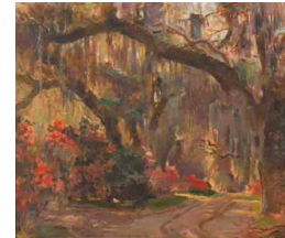
Title: Untitled Date: by 1978 Primary Maker: Hattie Saussy Medium: oil on canvas