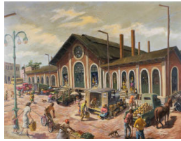
Title: Old City Market Date: c. early 1950s Primary Maker: Augusta Denk Oelschig Medium: oil on Masonite