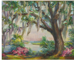
Title: Untitled Date: by 1969 Primary Maker: Lila Marguerite Cabaniss Medium: oil on canvas