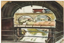
Title: Untitled Date: 1944 Primary Maker: Emil Holzhauer Medium: watercolor on paper