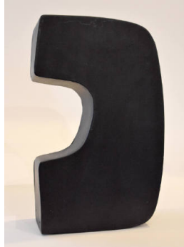
Title: Free Standing Form Date: 1961 Primary Maker: Conrad Marca-Relli Medium: painted aluminum