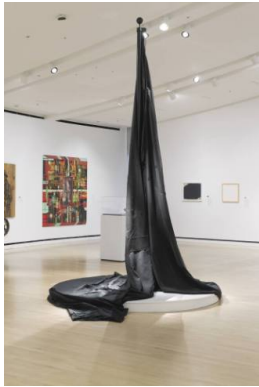
Title: Black Cotton Flag Made In Georgia Date: 2018 Primary Maker: Paul Stephen Benjamin Medium: Black cotton and black thread