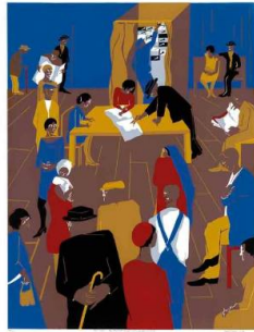
Title: The 1920s...The Migrants Arrive and Cast Their Ballots Date: 1974 Primary Maker: Jacob Armstead Lawrence Medium: Screenprint on paper