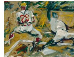
Title: Baseball Players Date: 1953 Primary Maker: Elaine de Kooning Medium: Oil on canvas mounted on board