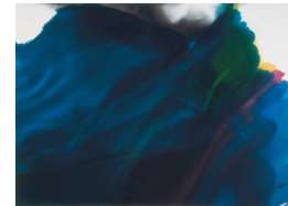
Title: Phenomena Break of Dawn Date: 1983 Primary Maker: Paul Jenkins Medium: gouache on arches paper