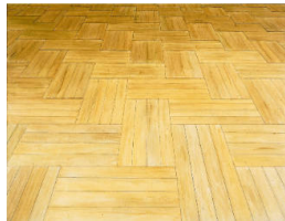
Title: Untitled Date: 1970 Primary Maker: Sylvia Plimack Mangold Medium: Acrylic and pencil on canvas