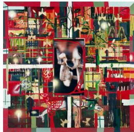
Title: Untitled Date: 1999 Primary Maker: Radcliffe Bailey Medium: Acrylic, photograph, plexiglass, oil stick, resin, spray paint, glitter and velvet pouch with key