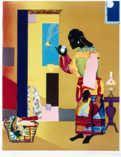
Title: Falling Star Date: 1979 Primary Maker: Romare Howard Bearden Medium: Lithograph on paper